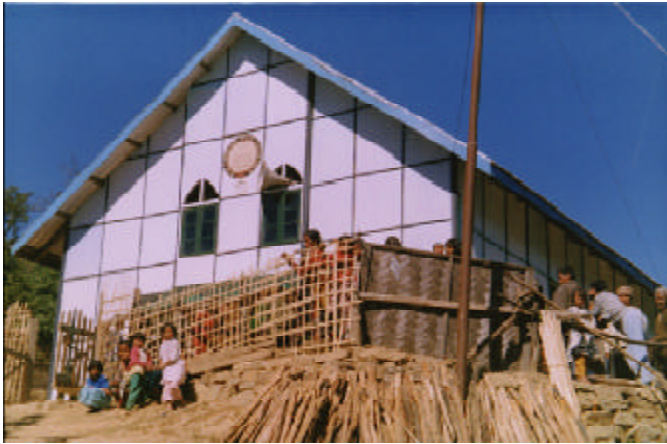
EBC Biakinn Daido Thanlon District