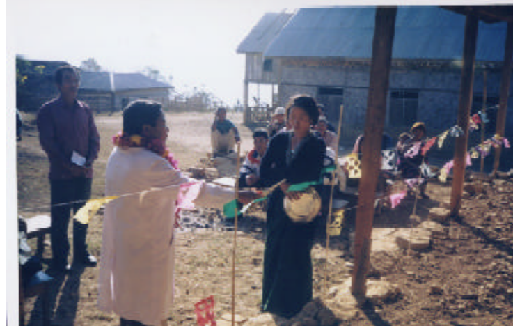
Songtal JB School inn behlapna Director (I) hon khiakna leh Pathian kianga Latna a nei hi.