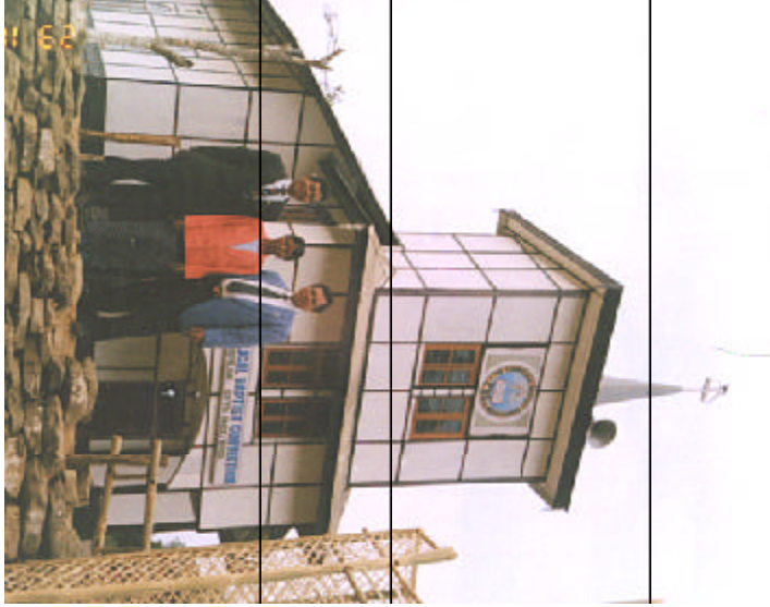
EBC Biakim Bungpilon