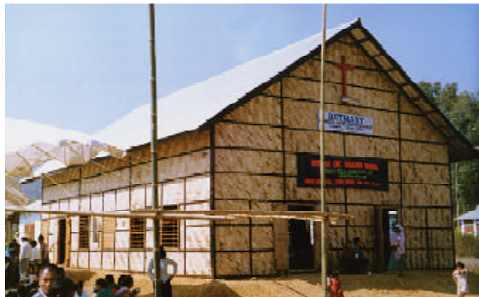
EBC Biakinn Bethani, Bungmual Lamka District