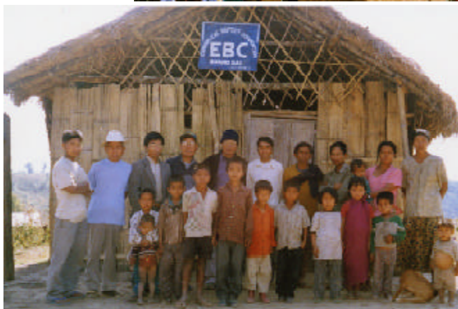
EBC Biakinn Suangdai Singngat District