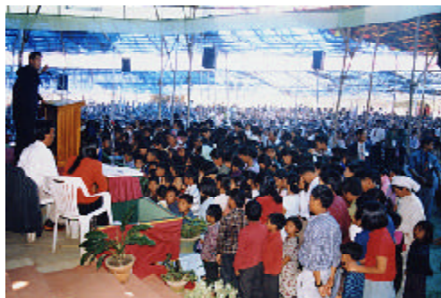
Maitam sapna huna Jesu kiang zuan a hongpai mipite ahi.