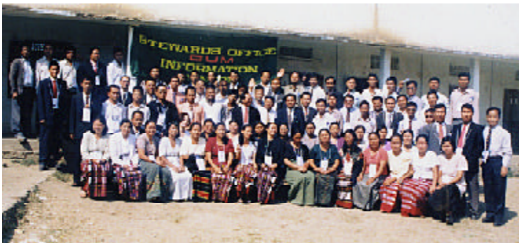
Citiwide Crusade sunga Steward Papi leh Nupi 100te lemlak ahi