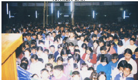
Crusade sunga maitam sapna nanungpen a hongpai Jesu kiang zuante ahi uh.