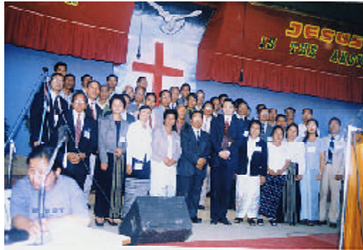
Citiwide Crusade sunga Counsellorte leh Thugentu leh Kamlettute lemlak ahi.