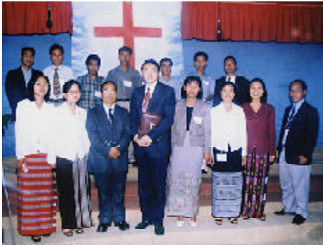
Crusade sunga Lapitute leh Thugentu leh Kamlettute lemlak ahi.