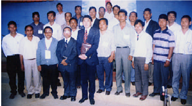
Crusade Hall bawlna dia sai Pawlte leh Thugentu leh Kamlettute lemlak ahi.